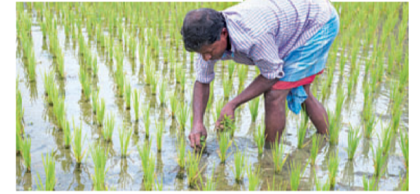
Sowing of kharif crops as on Aug 12 (In mn hectares)

In several states, farmers have moved on to other short duration crops, such as pulses and coarse cereals abandoning paddy. According to the India Meteorological Department (IMD), between June 1 to August 12, cumulatively across the country the southwest monsoon is around 8 per cent more than normal but in major paddy growing states of UP (-44 per cent), West Bengal (-21 per cent), Jharkhand (-41 per cent), and Bihar (-38 per cent). In Telangana, which is another major paddy-growing state, crops have been damaged due to excess rains (+78 per cent).