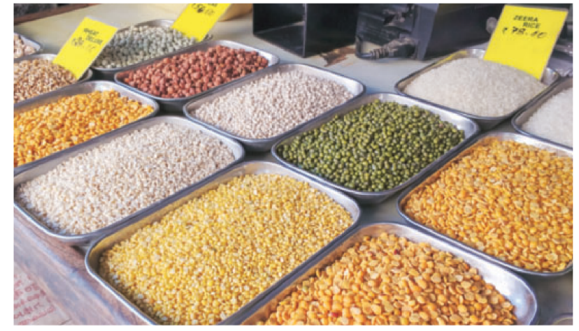
Traders may be asked to disclose stocks held by them in a centralised portal to ensure smooth monitoring of inventory

"The Centre wants private stocks held with traders to come into the market